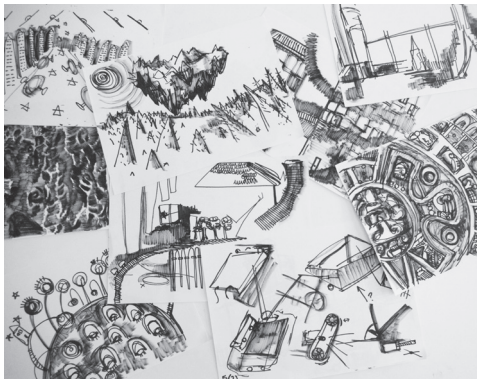
Lucy Smalley. Sketches for an Unseen Future , 2017. Ink on A4 paper

DATES & TIMES Mon 24 April, 10:00–16:00 Tue 25 April, 10:00–16:00